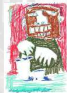
DRAWING BY SAMUEL TAYLOR

Once home, I discovered the news that Frenchette made a list of the top ten new restaurants in New York City 2018. If asked, I would agree.